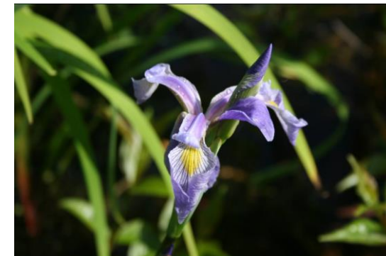
Images, de gauche à droite: Souci d'eau, Eastern Thuya occidentale: © Michael Lee. Asclépiade tubéreuse, Iris versicolore: © Ben Porchuk